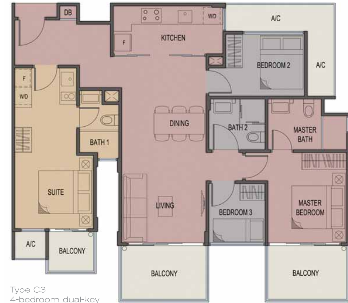
Type C3 4-bedroom dual-key

Make euphoria the foundation of your life with the bespoke dual-key units. Enjoy the comfort and revenue of owning not just one, but two homes, with a single purchase. Keep both homes for never-ending self-indulgences, or live in harmony with other family members without compromising on privacy. For a lucrative investment opportunity, select your preferred home and rent out the other; or rent out both homes to maximise your investment returns.